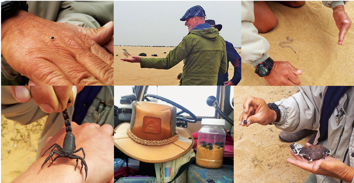
The fascinating wildlife of the desert. You only notice these creatures once you stop and really look. It is amazing how easy it is to miss the abundant life of the desert. The creatures have adapted well to the harsh environment.

Tommy says the chameleons are popular pets and sell for €5000 on the black market. "People like strange things, but we are part of an international effort to protect the reptiles by installing tracking chips. Later tonight, I have to chip two chameleons and five snakes. The snakes can bite through welding gloves. And I don't wear any!"